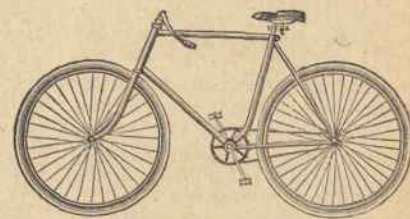
(SEE THAT CURVE.)