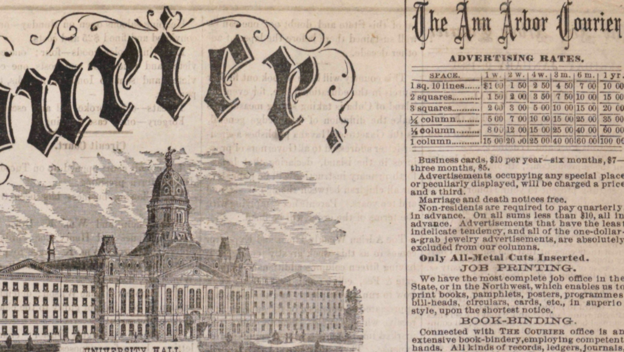
ANN ARBOR, MICHIGAN, FRIDAY, JANUARY 9, 1880.