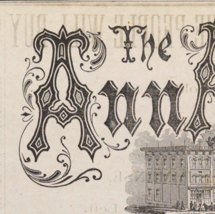
ANN ARBOR, MICHIGAN, FRIDAY, JANUARY 9, 1880.