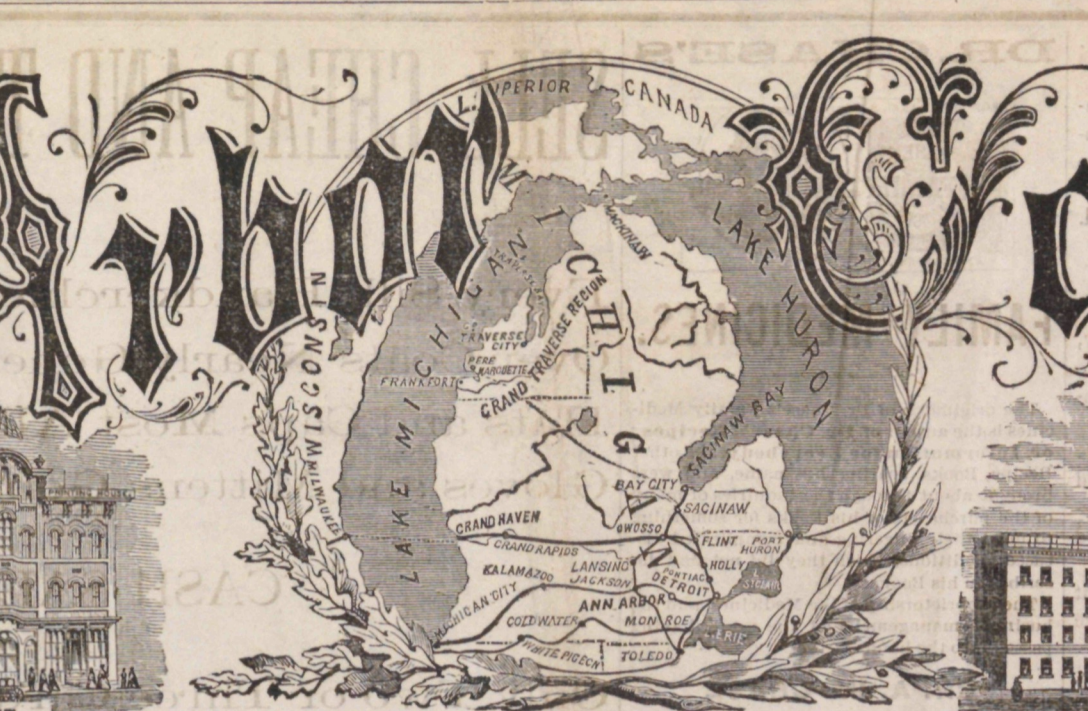
ANN ARBOR, MICHIGAN, FRIDAY, JANUARY 9, 1880.