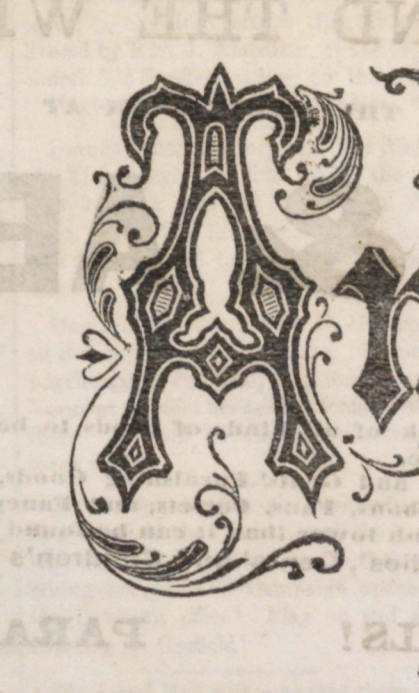
CASTLES IN SAND.