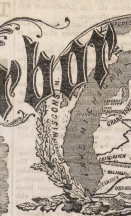
THE CHICAGO CONVENTION.