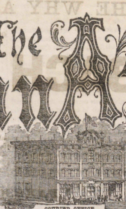
AMONG OUR EXCHANGES.

THE ANN ARBOR SAVINGS BANK. Ann Arbor, Michigan.