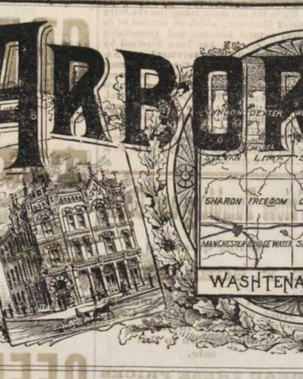
MAP OF WASHTENAW COUNTY.