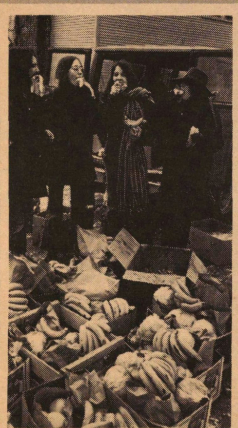
On the first run of the People's Produce Co. to Detroit's Eastern wholesale market, February, 1971.

The People's Food Committee could involve even more people if there were a large building like the People's Ballroom to become a main distribution and sign-up point for the co-op as well as a dance/concert location for a munchies stand.