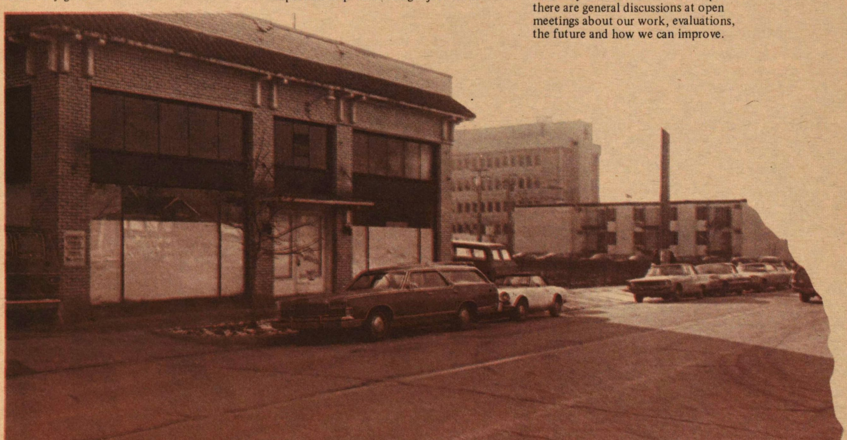
Pictured above is the building Tribal Council is proposing for a new People's Ballroom and Community Center. Located at 514 E. Washington St., the building is now being used by the University Art School, which plans to vacate it this spring. Tribal Council was about to put a $10,000 down payment in to secure the structure when the Republicans on City Council voted to cancel the contract which provided city money for its purchase.

Besides practical experience at different jobs there are training sessions and meetings/discussions to attend. Many of the Rangers are certified in Overdose Aid and First Aid with both course being offered periodically for more new people. Every Thursday for two hours from 4-6pm there are general discussions at open meetings about our work, evaluations,