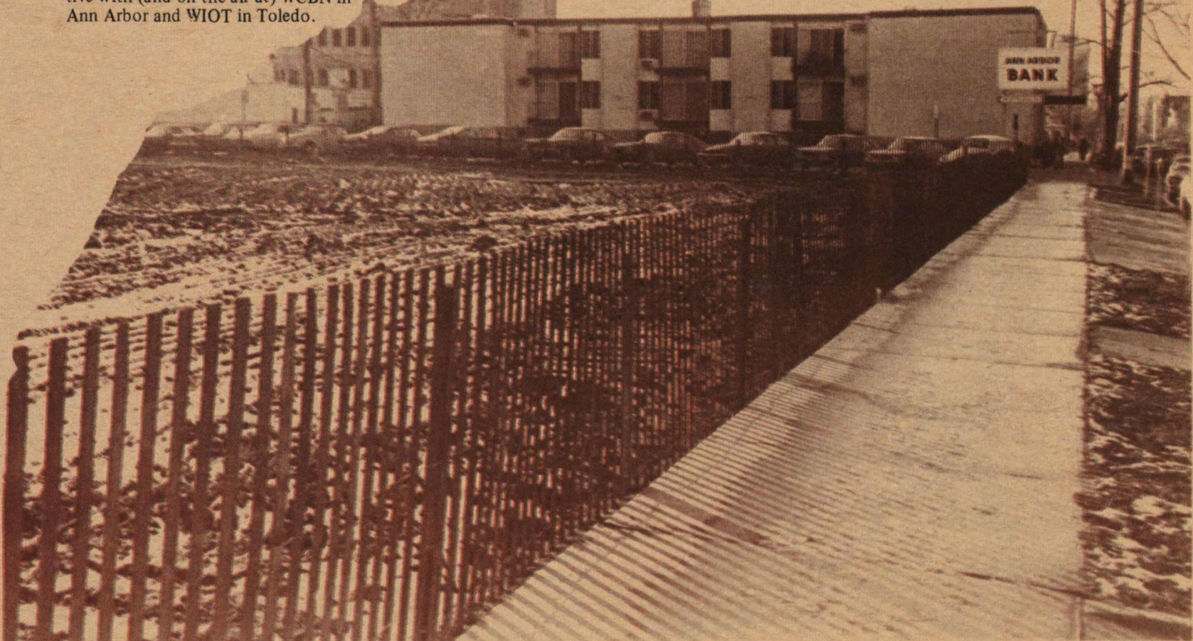
The bulldozed-over site of the former People's Ballroom, which operated for several months in 1972 before it was destroyed by fire last December 15th. The site is immediately adjacent to the building Tribal Council hopes to transform into a new Ballroom and Community

When the People's Ballroom was open the CCC provided free child care. This is an extremely important program in that it provides a place for young parents to go where they can take their kids and be assured of quality care. The Ballroom itself could be used by the CCC for physical education, dance classes, music classes (local musicians have already volunteered to teach), and to have the benefits.